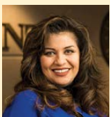
Ruth Pérez President Position 6

Information on the City Council can be found at rentonwa.gov/council .